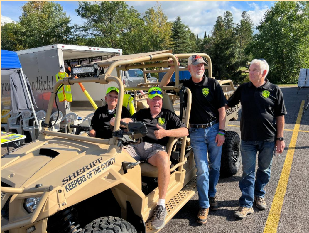
Above: Members of the Cass County Search And Rescue ATV Team displayed the military RZR used on missions, and to help deputies monitor trails and assist at community events. Members of the Woodtick Wheelers and Over The Hills Gang clubs participate in the SAR program.