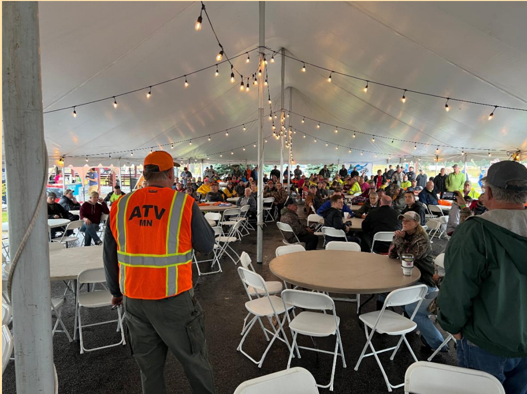
Above: Event receptions, the general membership meeting with elections, updates from the DNR, raffle drawings, entertaining video productions, and live bands were staged under a giant tent with room for 400 riders.