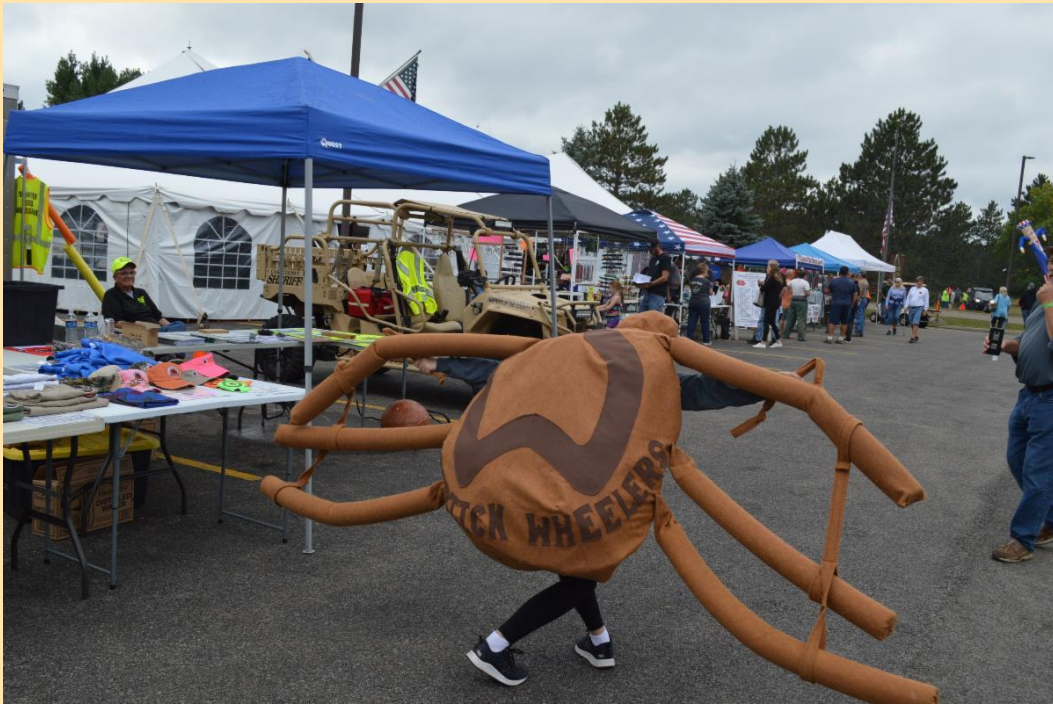
Above: Corporate, business and club sponsors totaled 70 this year, many with displays of their products, club gear...and a dancing woodtick.