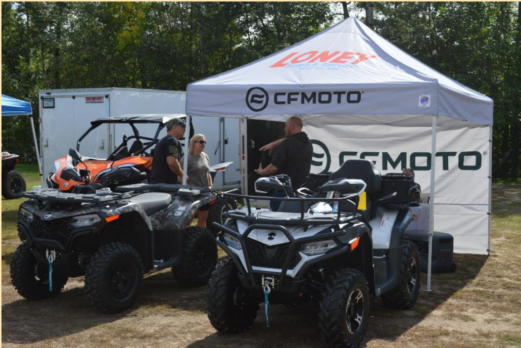
Above: Loney Sales & Service, Walker, a Platinum Sponsor, displayed the latest CFMOTO vehicles, answering many rider questions during the ATV Fair on Saturday.