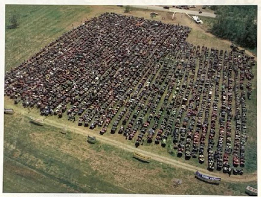
Last June, more than 1,600 ATV riders get ready to break the record for the world's longest ATV parade.

To view the official Guinness Record, check out www.guinnessworldrecords. com. Click on Search the Site and enter "The Largest Parade of Quadbikes (ATVs)" in the search box. OR