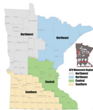
ATV Minnesota Regions

If you are the admin for a Facebook page of one of the old Regions 1 through 6, please change the name of your Facebook page to match the new ATV Minnesota Region areas. Some clubs have changed Regions. Check the ATV Minnesota website to confirm your Region area.